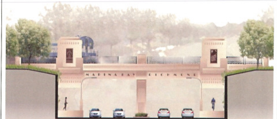
OPTION B: ENHANCED DESIGN ELEVATION AT MARINA BAY PARKWAY

For further information or questions, please contact Richmond Community Redevelopment Agency Staff at 510.307.8140, or visit: http://www.ci.richmond.ca.us/index.aspx?NID=951 .