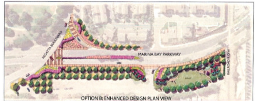
OPTION B: ENHANCED DESIGN PLAN VIEW

Option B includes the addition of usable open space, expanded landscaping limits, and enhanced aesthetic upgrades on Marina Bay Parkway from Regatta Boulevard to Meeker Avenue. Construction duration will be 20 months with the closure of Marina Bay Parkway from Jetty Drive to Meeker Avenue until the completion of construction. This option is fully funded through construction. The shortened construction duration will provide cost savings that will be allocated to the addition of usable open space, expanded landscaping limits, and enhanced aesthetic upgrades.