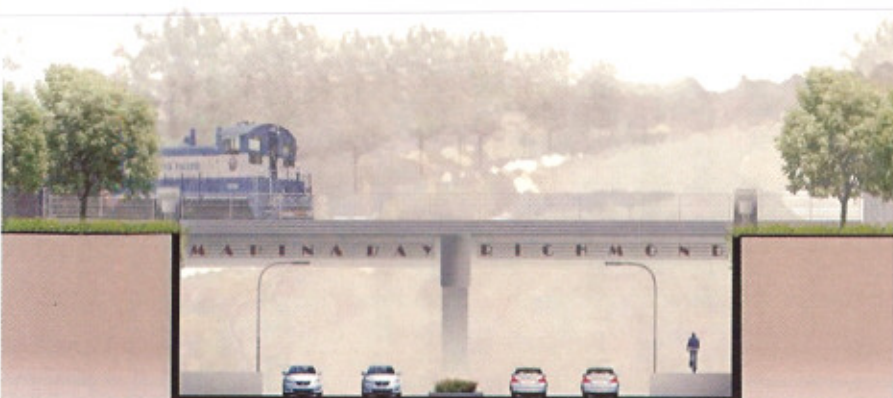
OPTION A: BASE DESIGN ELEVATION AT MARINA BAY PARKWAY

For further information or questions, please contact Richmond Community Redevelopment Agency Staff at 510.307.8140, or visit: http://www.ci.richmond.ca.us/index.aspx?NID=951 .